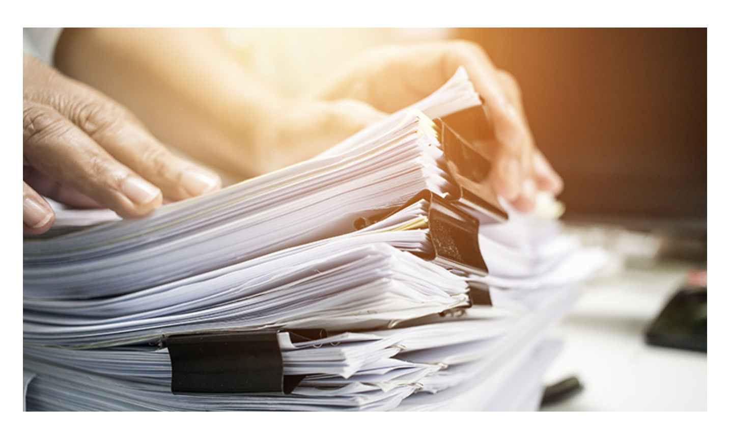
It's all in the detail!